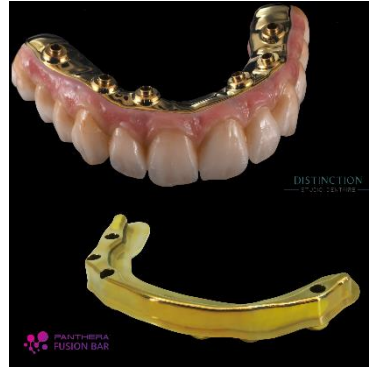
Fig. 2. PFB, final result, credit: Hugo Hébert