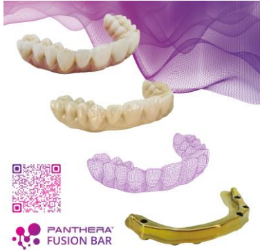
Fig. 1. Panthera Fusion Bar™ solution