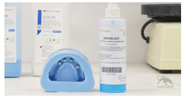
- 18 - The working model is complete.

Spray the silicone mould with debubblizer and ensure that it is well dried before pouring up the working model. It is also imperative to let the mould rest 10 - 15 minutes before pouring up the working model.