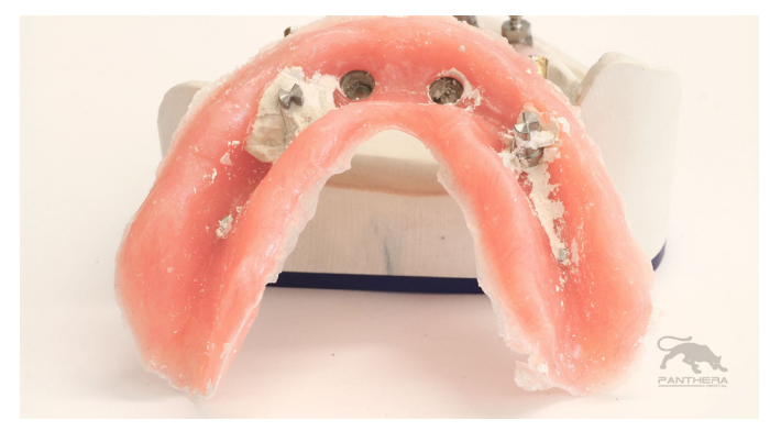
- 27 -Completed Lock and Release bar.

- 25 -Deflask the denture, remove the processing pins and trim and polish the denture as normal.