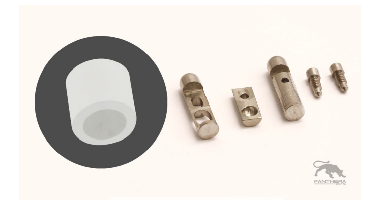
- 9 -Cut out the silicone to expose the processing pins.

- 7 -Remove the all the parts, ensure the nylon cylinder is also removed.